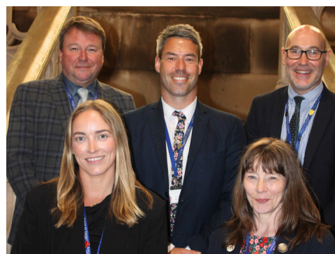
The Attendance Team