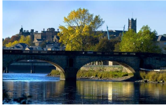
The Historic City