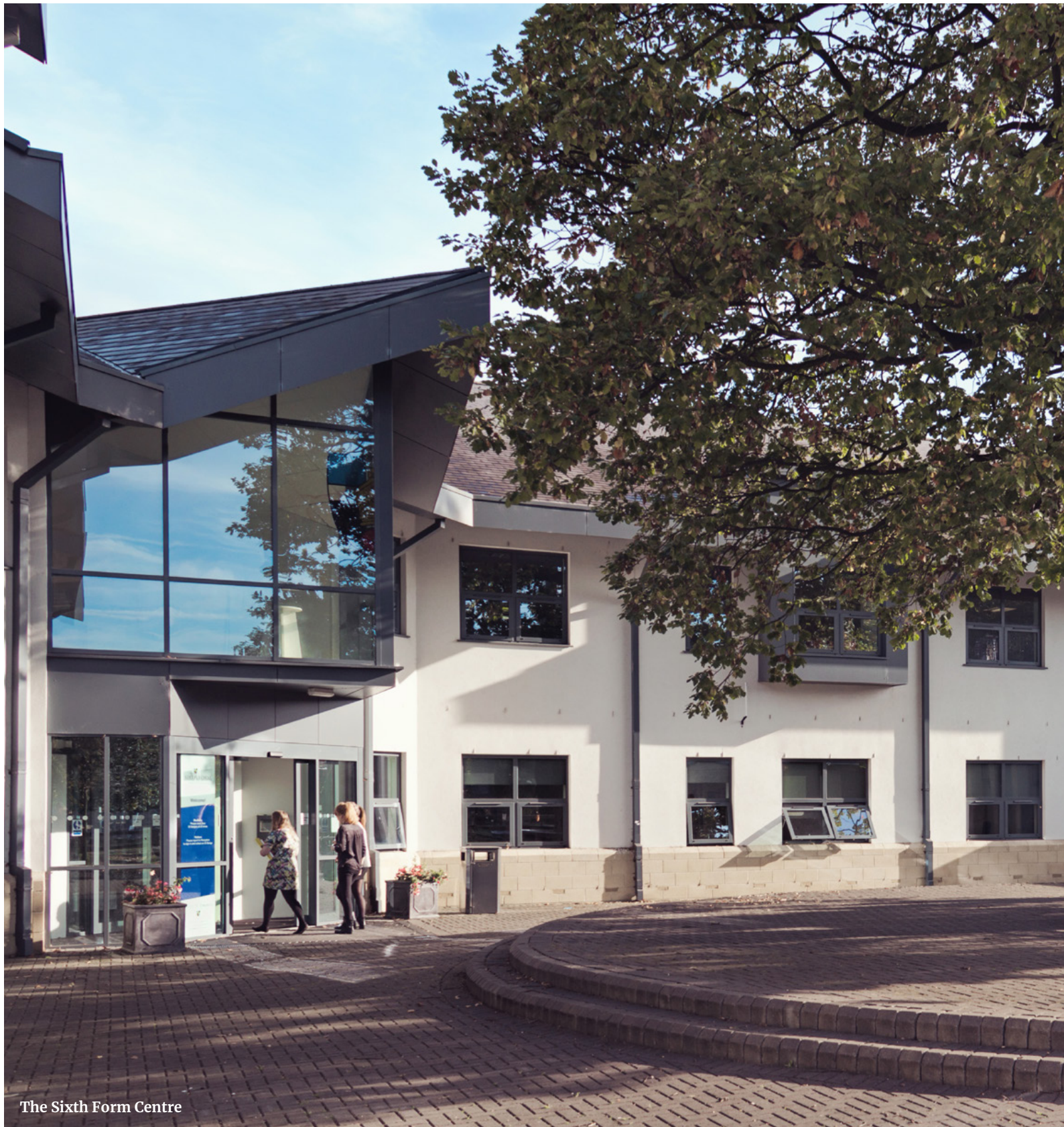
The Sixth Form Centre