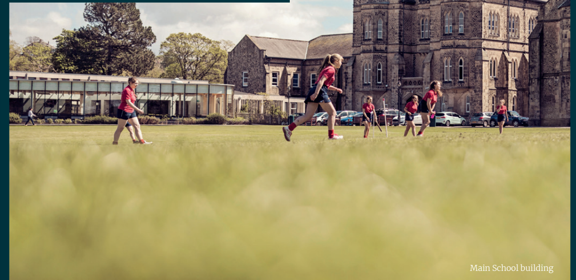
Main School building