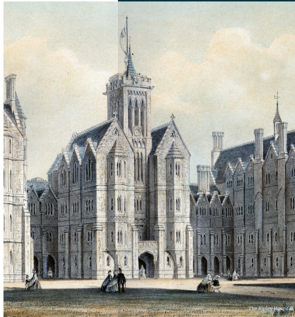
The Ripley Hospital

Ripley St Thomas sets up The Bay Learning Trust, a multi-academy trust bringing together a community of like-minded schools.