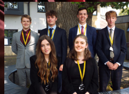
Sixth Form Student Leadership Team

In our second year here now, we can all confidently agree that the Sixth Form’s perfect balance of teacher support as well as independence, whether academic or personal, has shaped us ready for life after Year 13. Regardless of whether you’re new to Ripley or not, the inclusive environment ensures a welcoming atmosphere for all.”