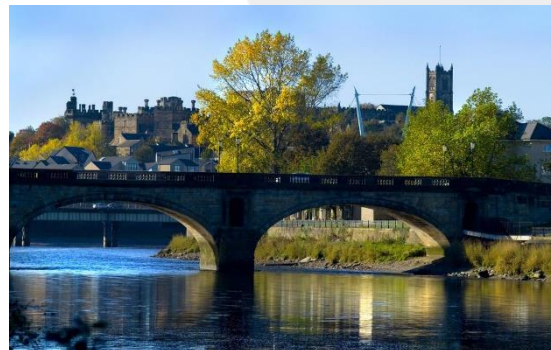
The Historic City

Despite being a university city and home to 138,000 people, over two thirds of Lancaster is classed as rural area. Surrounded by many pretty villages, it is a very pleasant place to live. Lancaster benefits from excellent rail and road links, indeed the school is easily accessed from the M6 motorway. The city offers the usual attractions of a vibrant place to live, but also has some beautiful areas of outstanding natural beauty on the doorstep. The coast is easily accessed; Blackpool, the beautiful Fylde Coast and Morecambe Bay are within 40 minutes' drive. The Lake District is 30 minutes away. Liverpool and Manchester are less than 1 hour away. London is less than 3 hours away by train, with Lancaster being a mainline west coast station, giving easy access to Scotland.