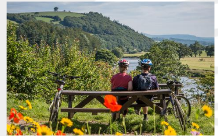
Crook O' Lune