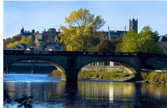
The Historic City

Despite being a university city and home to 138,000 people, over two thirds of Lancaster is classed as rural area. Surrounded by many pretty villages, it is a very pleasant place to live. Lancaster benefits from excellent rail and road links, indeed the school is easily accessed from the M6 motorway. The city offers the usual attractions of a vibrant place to live, but also has some beautiful areas of outstanding natural beauty on the doorstep. The coast is easily accessed; Blackpool, the beautiful Fylde Coast and Morecambe Bay are within 40 minutes' drive. The Lake District is 30 minutes away. Liverpool and Manchester are less than 1 hour away. London is less than 3 hours away by train, with Lancaster being a mainline west coast station, giving easy access to Scotland.