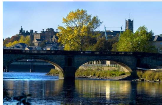
The Historic City

Despite being a university city and home to 138,000 people, over two thirds of Lancaster is classed as rural area. Surrounded by many pretty villages, it is a very pleasant place to live. Lancaster benefits from excellent rail and road links, indeed the school is easily accessed from the M6 motorway. The city offers the usual attractions of a vibrant place to live, but also has some beautiful areas of outstanding natural beauty on the doorstep. The coast is easily accessed; Blackpool, the beautiful Fylde Coast and Morecambe Bay are within 40 minutes' drive. The Lake District is 30 minutes away. Liverpool and Manchester are less than 1 hour away. London is less than 3 hours away by train, with Lancaster being a mainline west coast station, giving easy access to Scotland.