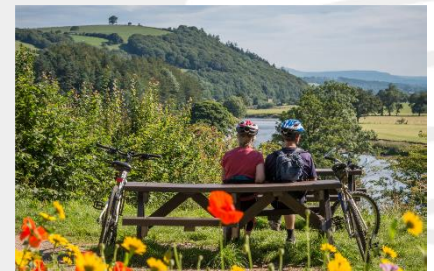
Crook O' Lune