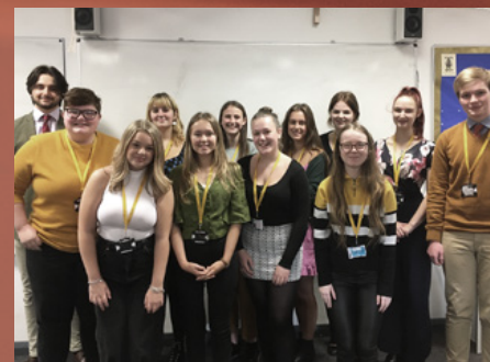
Sixth Form Senior Team

The Sixth Form is very inclusive, and strives to provide a wide range of academic and creative opportunities through enrichment activities and school teams. Even when working online, students benefit from the ongoing support of teaching staff and pastoral leaders. The size of our community allows for the full Sixth Form experience whilst feeling safe and supported by peers and teachers.”