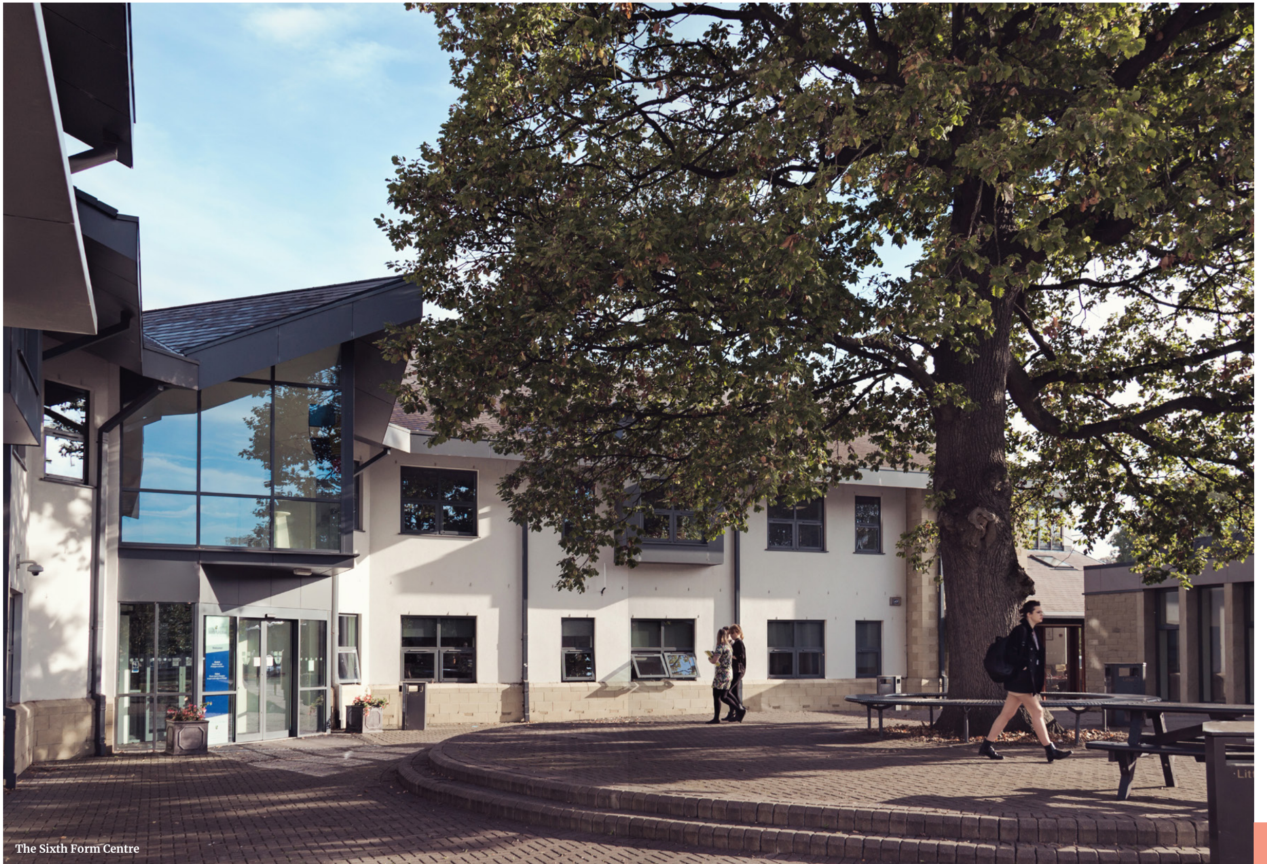
The Sixth Form Centre