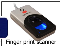
Finger print scanner

Oliver is the name of the Reading Room's web based database, or catalogue.